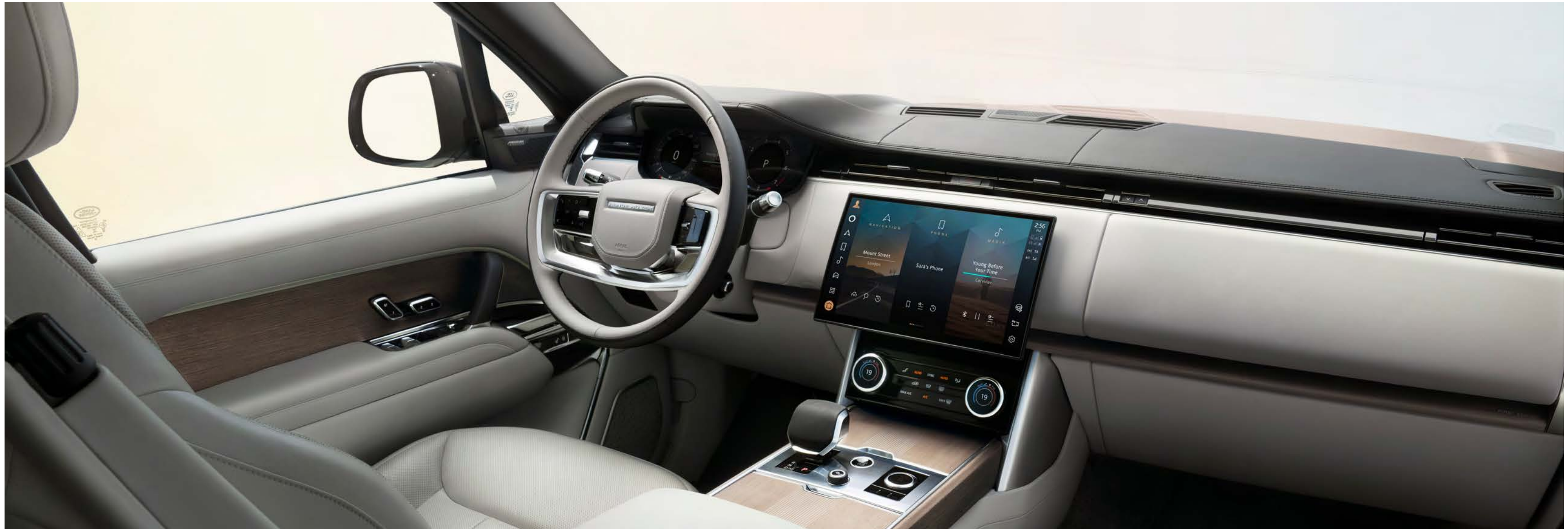
Interior shown is Range Rover First Edition in Perlino/Perlino with optional features fitted (market dependent).

Range Rover features a modern and sophisticated interior, underpinned by its impeccable reductive nature, tactile materials and an intuitive approach to relevant technology. No detail has been overlooked. Nothing is for show.