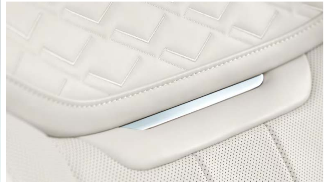
Vehicle shown is Range Rover SV in Icy White in Gloss finish with optional features fitted (market dependent).